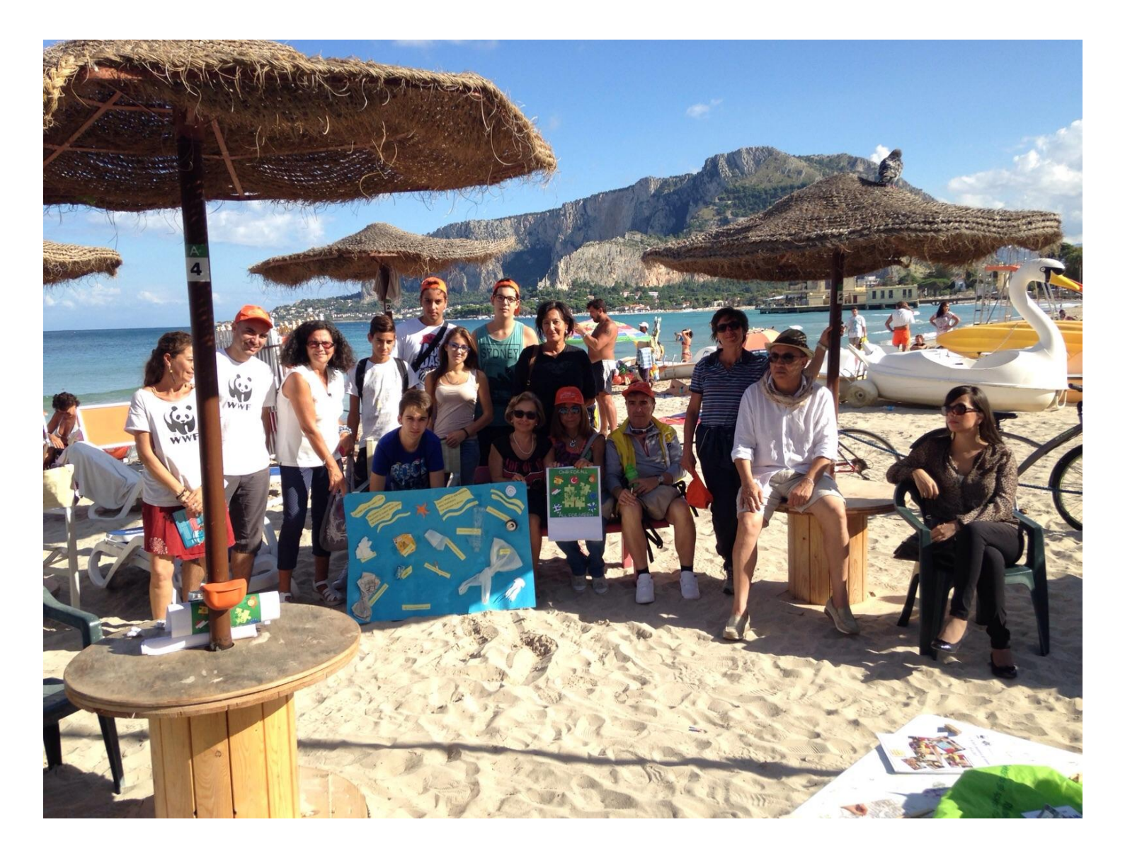
Smiling at Mondello Beach