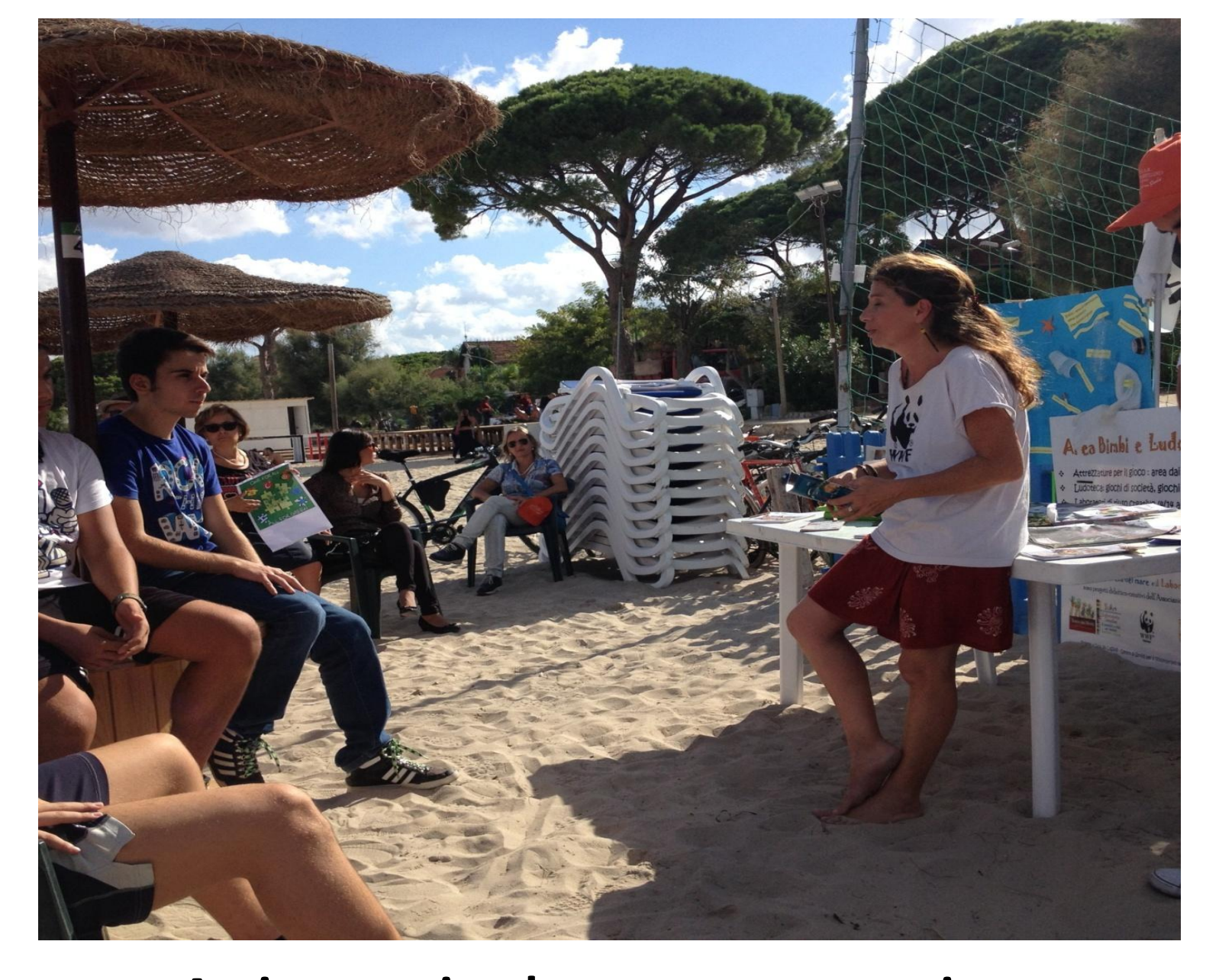
An interesting lesson on our environment protection